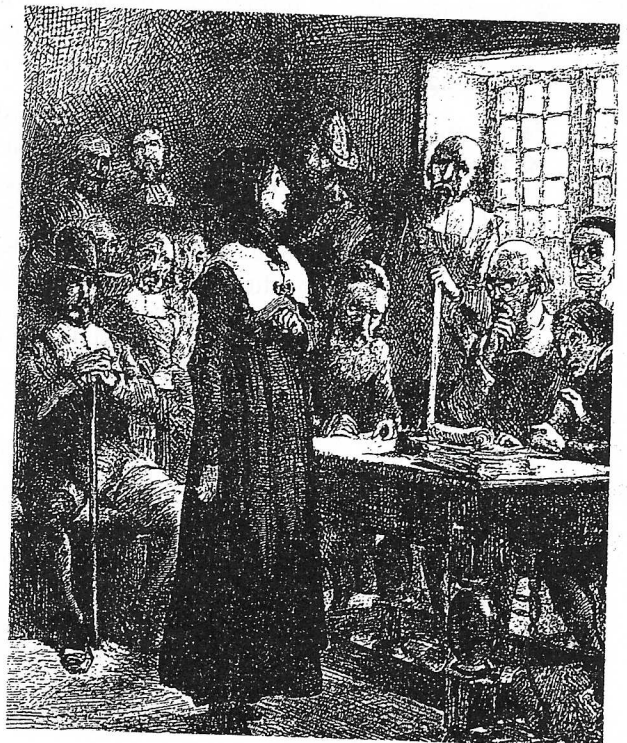
How did the colonial experience shape the Founders' views on freedom of religion?

By the time of the American Revolution, people had become more tolerant. The religious revival of the mid-eighteenth century, known as the Great Awakening , drew many away from established religions and into new